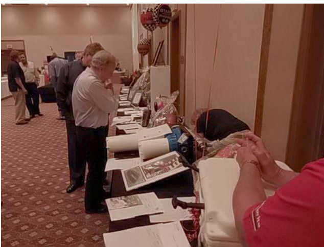
Silent Auction items — what a great opportunity to support FWQA and get some really great items.