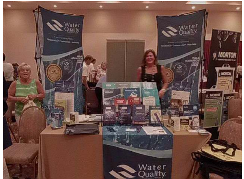
34 Exhibitors greeted those attending.